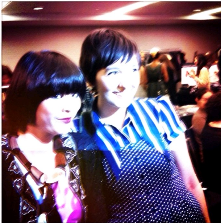
Dimepiece - Straight outta New York.