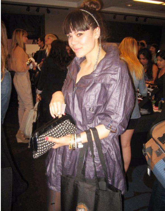
Lulu the Dog!